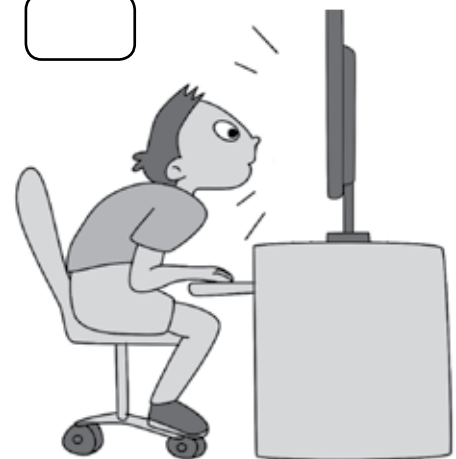
Sitting too close to the monitor