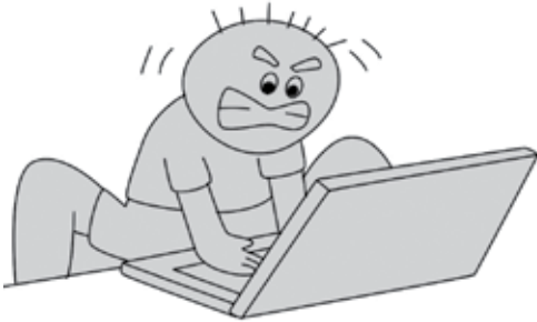
Mashing keyboard keys

Put a tick for dos and a cross for don'ts.