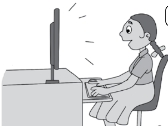
Sitting at proper distance from the monitor