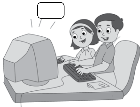
Sharing computer desk appropriately