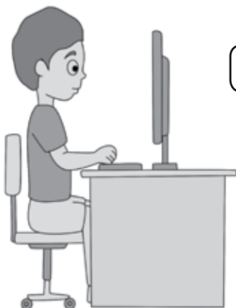
Sitting straight in front of the computer