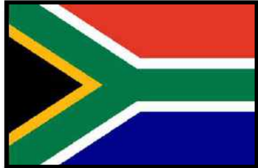
Timeline : 1994 - present