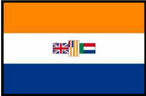
Timeline : 1928-1982

The national flag of South Africa has changed thrice in their history. Below given are the 3 versions. Cut out the flags in and paste them in the ascending order in the space given below.