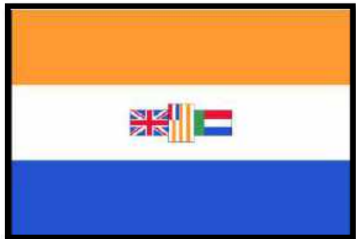
Timeline : 1982-1994