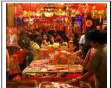
Chinese New Year

Lantern Festival or the spring lantern festival is one of the most popular festivals in Singapore. It marks the last day of celebration of the Chinese New Year (15th day). During this day, the kids carry paper lanterns outside, lit them up and release them in the sky. It's a magnificent sight to see several lanterns light up the night sky.