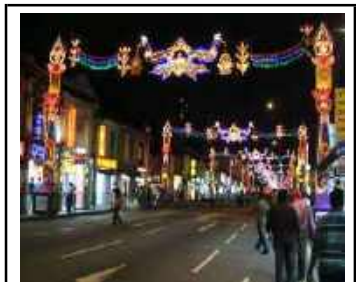
Hari Raya Puasa

Deepavali or Diwali marks the day Lord Rama returned to his kingdom. It signifies the victory of the good over the bad. During this day, Little India is lit up with lights and the skies are filled with dazzling fireworks in the night. People wear new clothes and greet each other. Before the day, some families clean their houses and make new purchases.